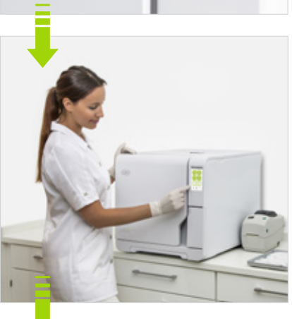
Step 2 Safe cycles

The simple menu guidance makes it easy to select the automatic sterilization cycles correctly.